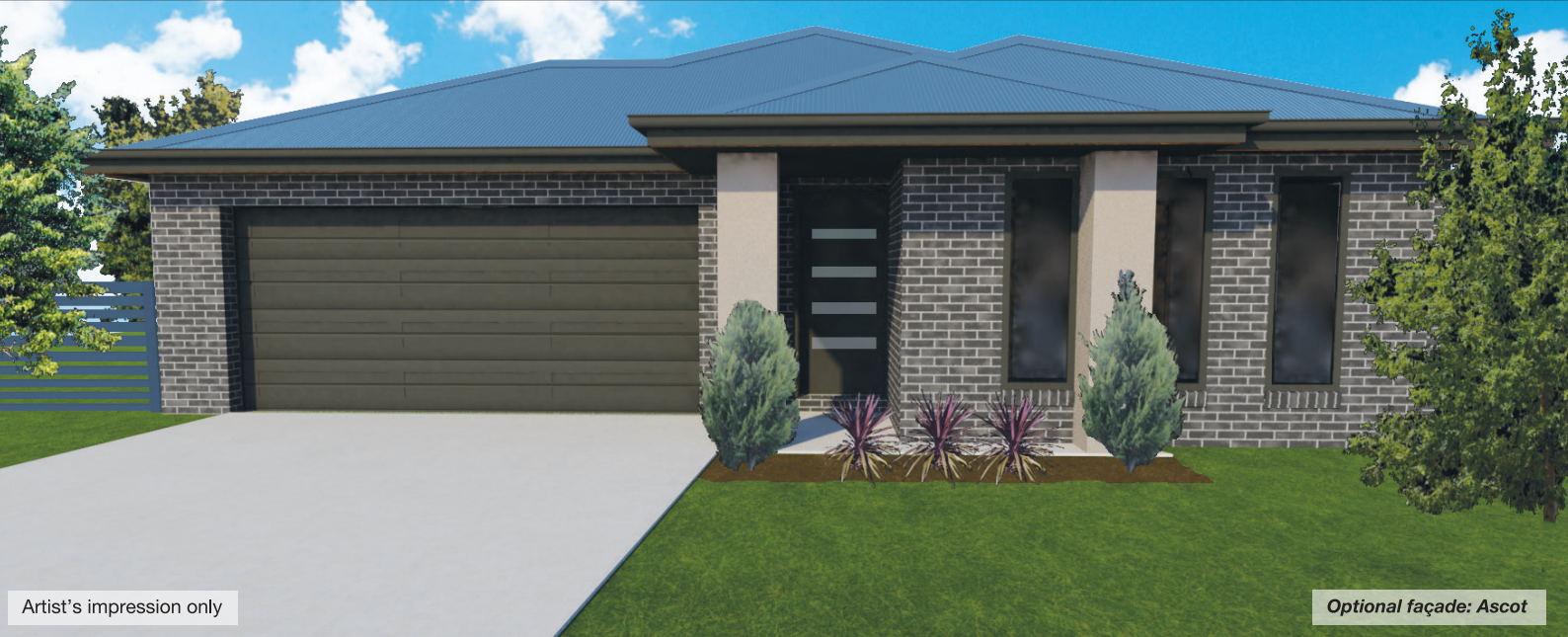
Artist's impression only